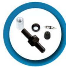
90° Black Straight Stem #25083