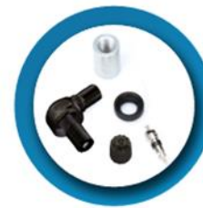
90° Black Angled Stem #25082

Includes: plastic sealing cap, aluminum clamp-in stem, nickel-plated valve core, nut and rubber grommet