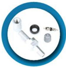
90° Aluminum Straight Stem #25080