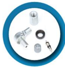
90° Aluminum Angled Stem #25078